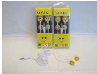
Emoji Earbuds - $3.50