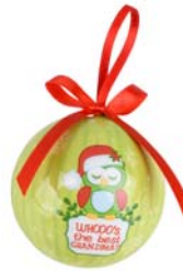
Grandma Ornament - $2.25