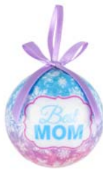
Mom Ornament - $2.25