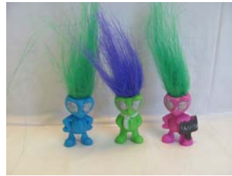
Alien Pencil Topper - $0.80