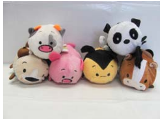
Bun Bun Plush - $3.00