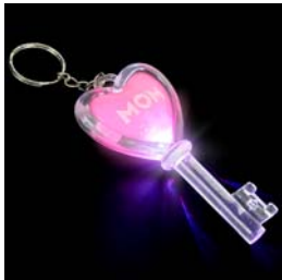
Mom Keychain - $0.80