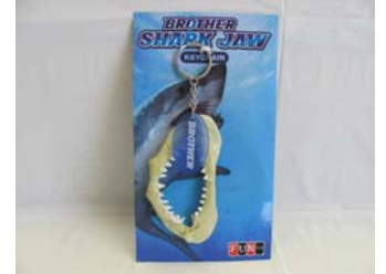
Brother Jaws K/C - $2.75