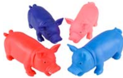
Snorting Pig - $3.50