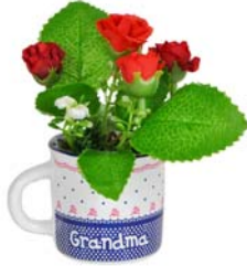
Grandma Flowers - $3.75 10% 20% 30% $4.25 $4.75 $5.50