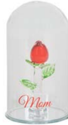
Mom Rose Dome - $3.75 10% 20% 30% $4.25 $4.75 $5.50