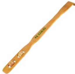
Dad Backscratcher - $1.75