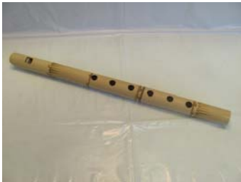
Bamboo Flute - $1.75