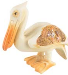
Pelican Statue - $4.50 10% 20% 30% $5.00 $5.75 $6.50