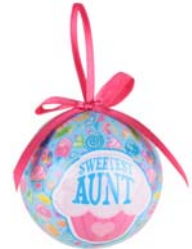
Aunt Ornament - $2.25