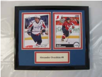
Alex Ovechkin Plaque - $4.50 10% 20% 30% $5.00 $5.75 $6.50