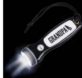
G'pa Light Magnet - $2.40