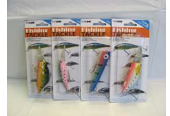
Fishing Lure - $2.40