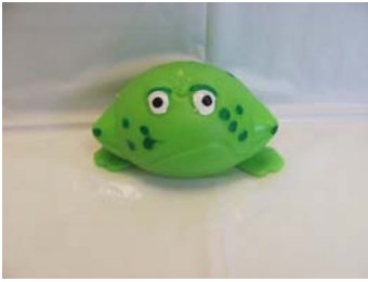
Splat Frog - $1.75

(School Prices are shown next to item – Student price shown below item for each markup level.)