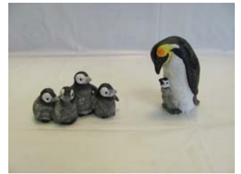
Playful Penguin - $1.75