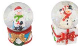
Snowman Waterglobe - $3.50