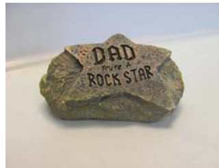
Dad Rock Star - $3.00