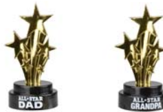
All Star Trophy - $0.90