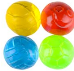
Jelly Ball - $0.45