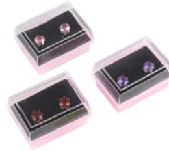
Stud Earrings - $2.40