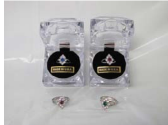
Cocktail Ring - $4.50 10% 20% 30% $5.00 $5.75 $6.50