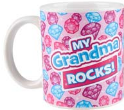
Grandma Mug - $3.25