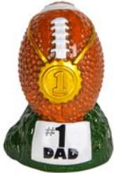
Dad Football Stand - $3.75 10% 20% 30% $4.25 $4.75 $5.50

(School Prices are shown next to item – Student price shown below item for each markup level.)