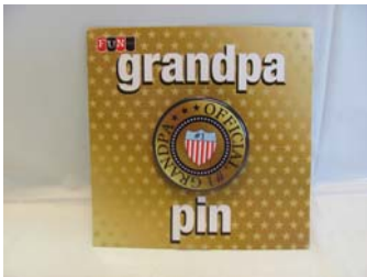
Grandpa Pin - $0.35