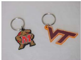
College Keychain - $2.40