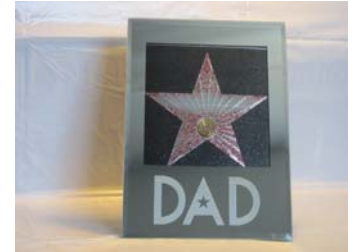
Dad Walk of Fame - $5.25 10% 20% 30% $6.00 $6.75 $7.50