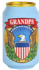
Grandpa Can Bank - $4.00 10% 20% 30% $4.50 $5.00 $5.75