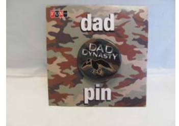
Dad Pin - $0.35