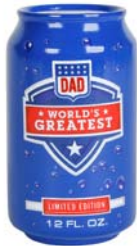
Dad Can Bank - $4.00 10% 20% 30% $4.50 $5.00 $5.75