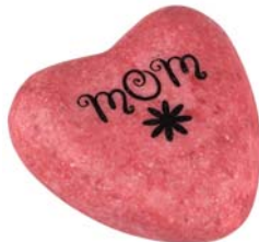
Mom Heart Stone - $3.00