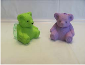
Bear Erase/Sharpen - $1.50

(School Prices are shown next to item – Student price shown below item for each markup level.)