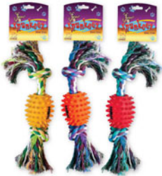
Dog Toy - $2.75