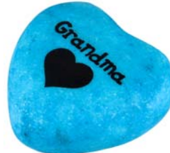
Grandma Heart Stone - $3.00