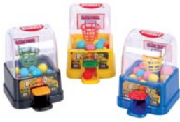
Slam Dunk Gumball - $3.00

(School Prices are shown next to item – Student price shown below item for each markup level.)