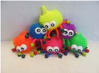
Light Up Puffer - $2.40

(School Prices are shown next to item – Student price shown below item for each markup level.)