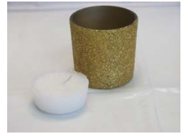
Glitter Candle Holder - $3.50