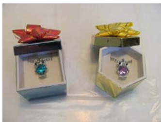
Owl Necklace - $4.50 10% 20% 30% $5.00 $5.75 $6.50