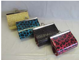
Coin Purse - $1.75