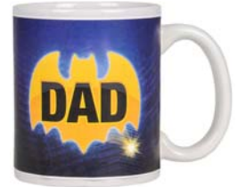
Dad Mug - $3.25