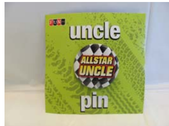
Uncle Pin - $0.35