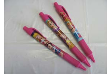
Disney Princess Pen - $3.00