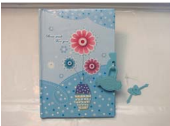
Diary - $3.50