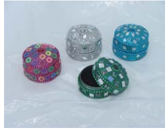
Glitter Trinket Box - $2.00