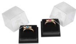
Princess Ring - $1.75