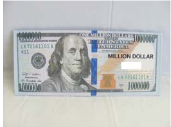
Million Dollar Wallet - $2.25