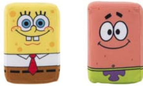
Spongebob/Patrick - $3.00