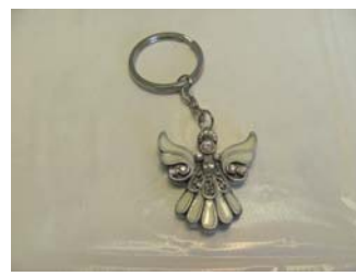
Angel Keychain - $2.40