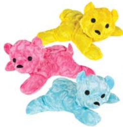
Laying Bear Plush - $1.75