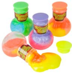
Wizards Brew Goo - $2.00