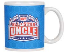
Uncle Mug - $3.25