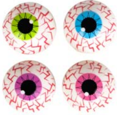
Eyeball Shape Eraser - $0.20

(School Prices are shown next to item – Student price shown below item for each markup level.)