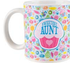
Aunt Mug - $3.25