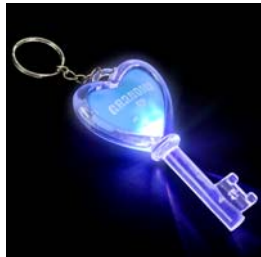
Grandma Keychain - $0.80