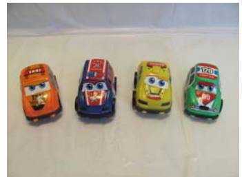
Cartoon Pull Back - $0.90