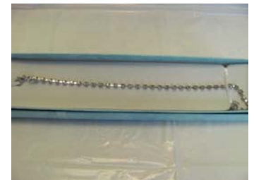
Tennis Bracelet - $3.50