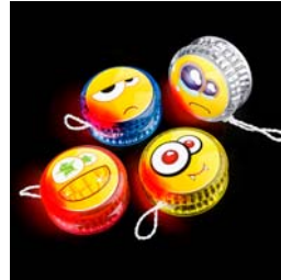
Emoji Yo-Yo - $1.50