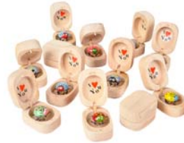
Bug in Box - $0.80