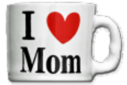
Mom Mini Mug - $1.75