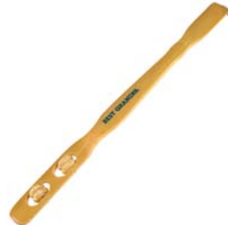
G'pa Backscratcher - $1.75