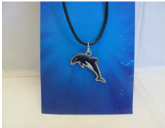
Dolphin Necklace - $1.75