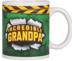
Grandpa Mug - $3.25