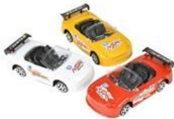
Friction Car - $3.00