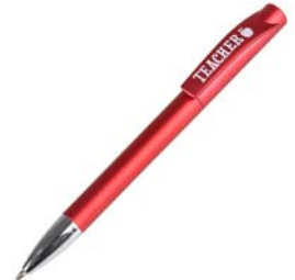
Teacher Pen - $1.50