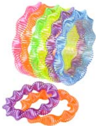
Twist Coil Bracelet - $0.45