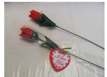
Silk Rose - $0.45