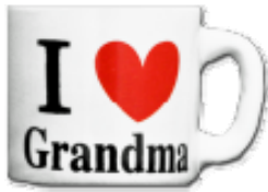
Grandma Mini Mug - $1.75