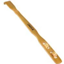
Uncle Backscratcher - $1.75