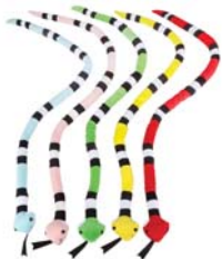
Snake Plush - $3.50