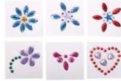
Body Jewels - $0.35