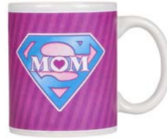
Mom Mug - $3.25