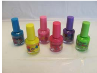
Nail Polish - $1.75