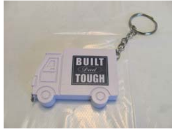
Dad Tape Measure - $1.50