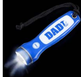
Dad Light Magnet - $2.40