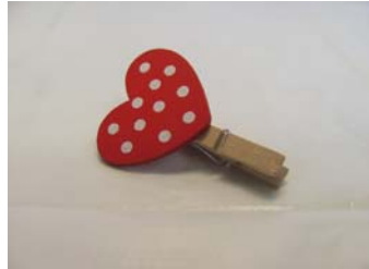
Heart Memo Clip - $0.20