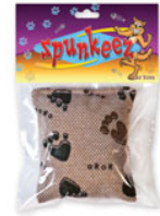
Cat Toy - $2.40