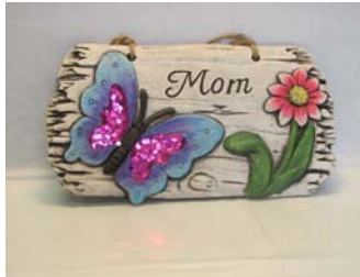
Mom Butterfly - $4.75 10% 20% 30% $5.50 $6.00 $7.00