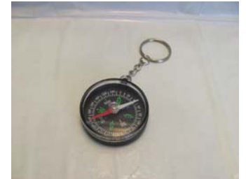
Compass - $0.80