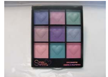
Eye Shadow Kit - $4.00 10% 20% 30% $4.50 $5.00 $5.75