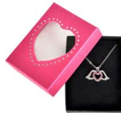
Heart & Wings N/L - $4.50 10% 20% 30% $5.00 $5.75 $6.50