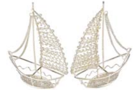
Sailboat - $3.00