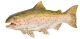
Wooden Trout - $3.75 10% 20% 30% $4.25 $4.75 $5.50